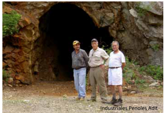
Industriales Penoles Adit

Geophysical Surveys on an area formerly mined by Penoles in the 1980s. There are huge benefits in acquiring a past producing property. Canadian Mining has inherited millions of dollars of infrastructure including a 10 kilometer access road, 3 kilometers of mine service roads, 10 kilometers of power transmission line from San Bernardo to the mine adit and mill site, mine underground development, buildings and a 300,000 tonnes tailing pond among other relevant assets.